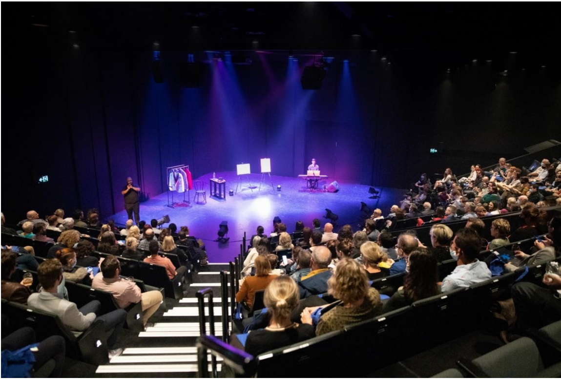
The No Bang Theory by Oliver Hetherington-Page