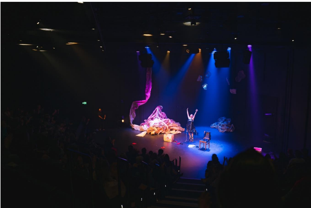
Happy-Go-Wrong by Andi Snelling