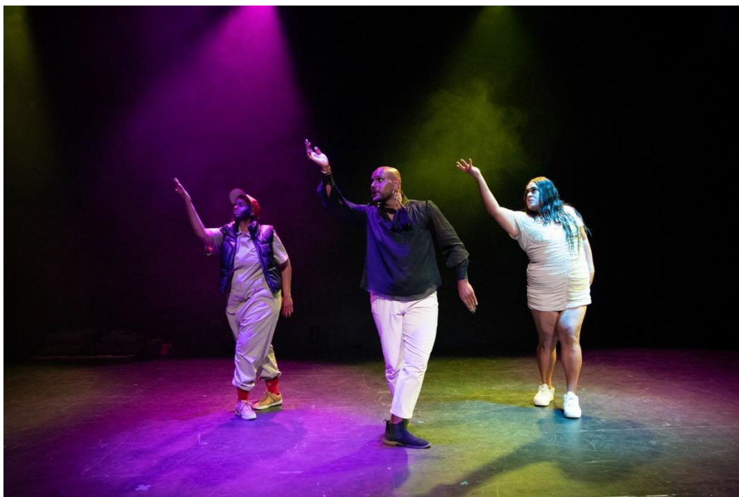
Brown Church by Naavikaran