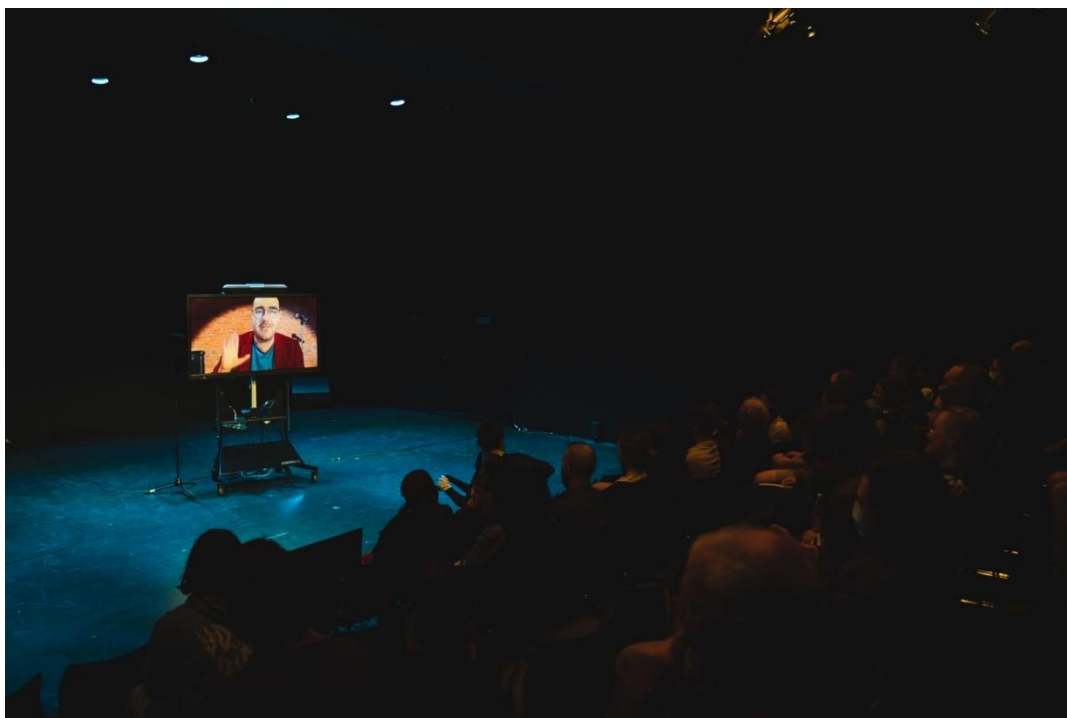
Comedy Club