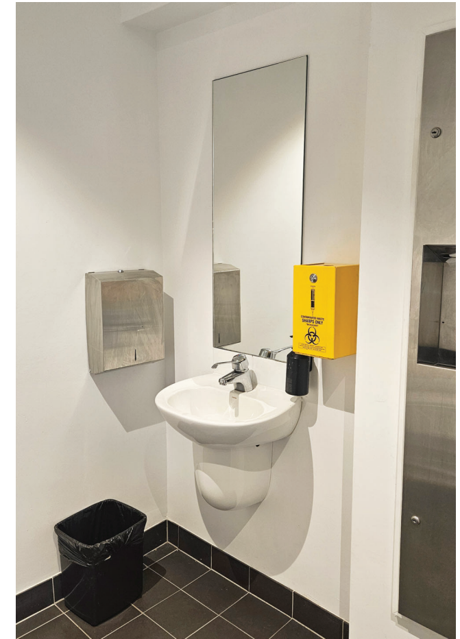
The sink and sharps disposal box.