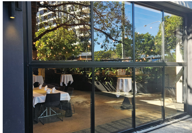
Windows will be raised during the event.