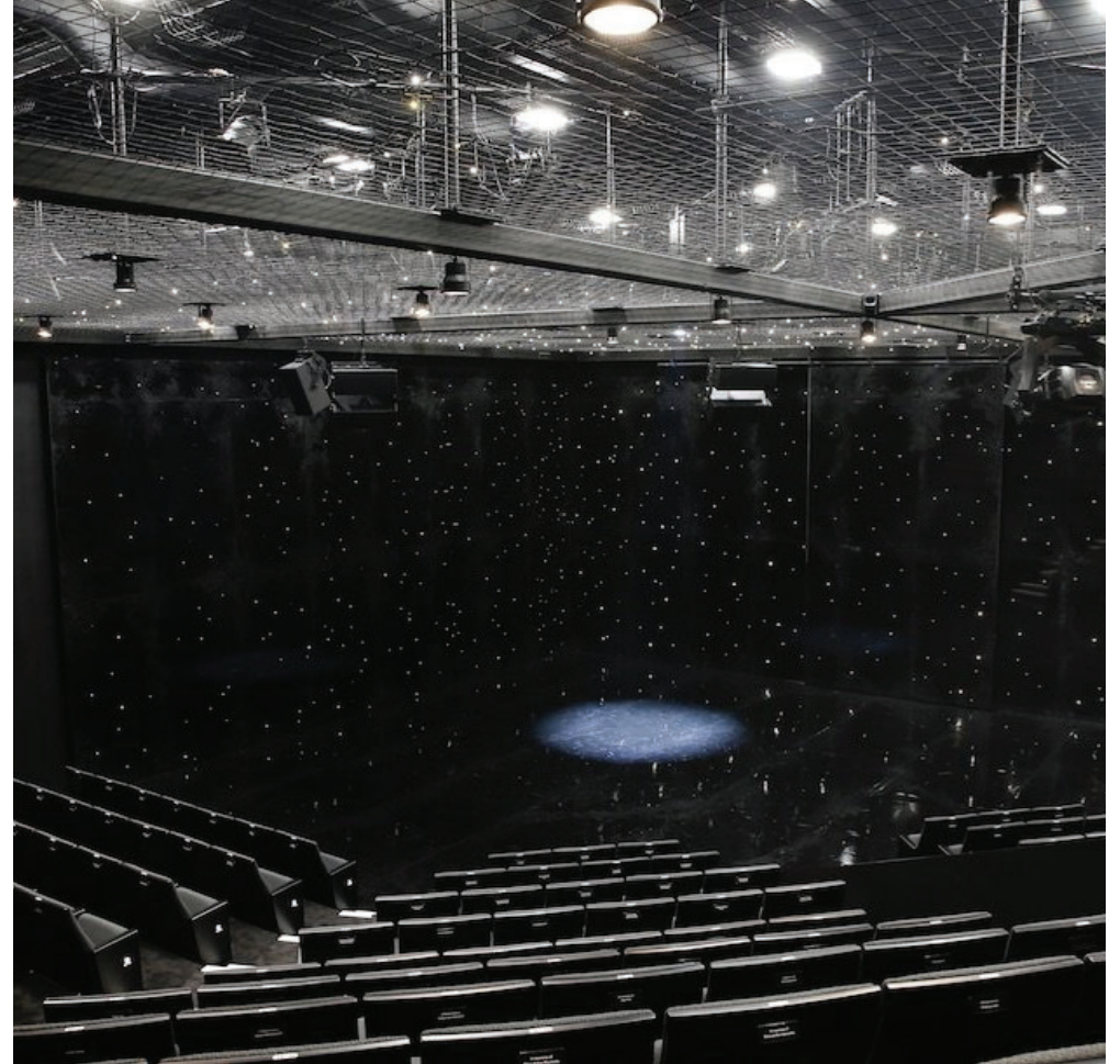
Inside the Bille Brown Theatre, looking towards the stage.