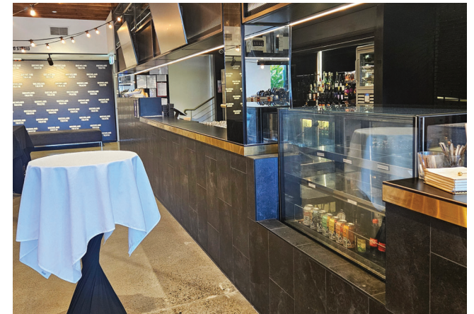
The Bar, on the right side of the Foyer.