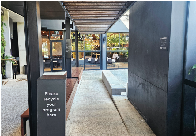
The ramp leading to the Foyer.