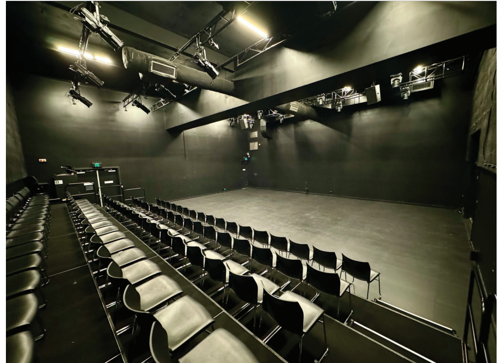
Inside the Studio, which seats approx. 88 people.