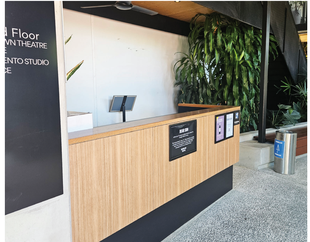
An additional counter will be available during the Festival, at a lower height.