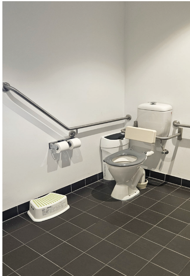
Inside the All User/Accessible bathroom.