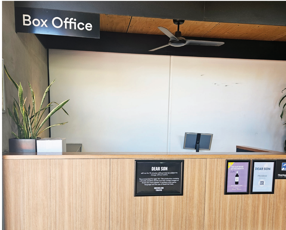
The Box Office, at the entry.

Through the glass sliding door is the Box Office . This is the best place to go if I have any questions about the venue or my tickets.