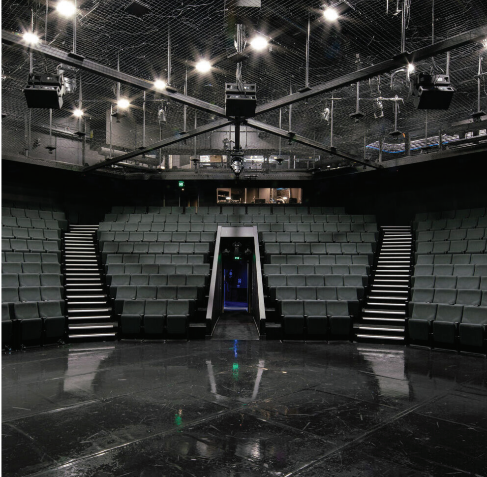
Inside the Bille Brown Theatre, which seats approx. 350 people.

When the doors open, ushers will check my tickets and guide me to my seat.