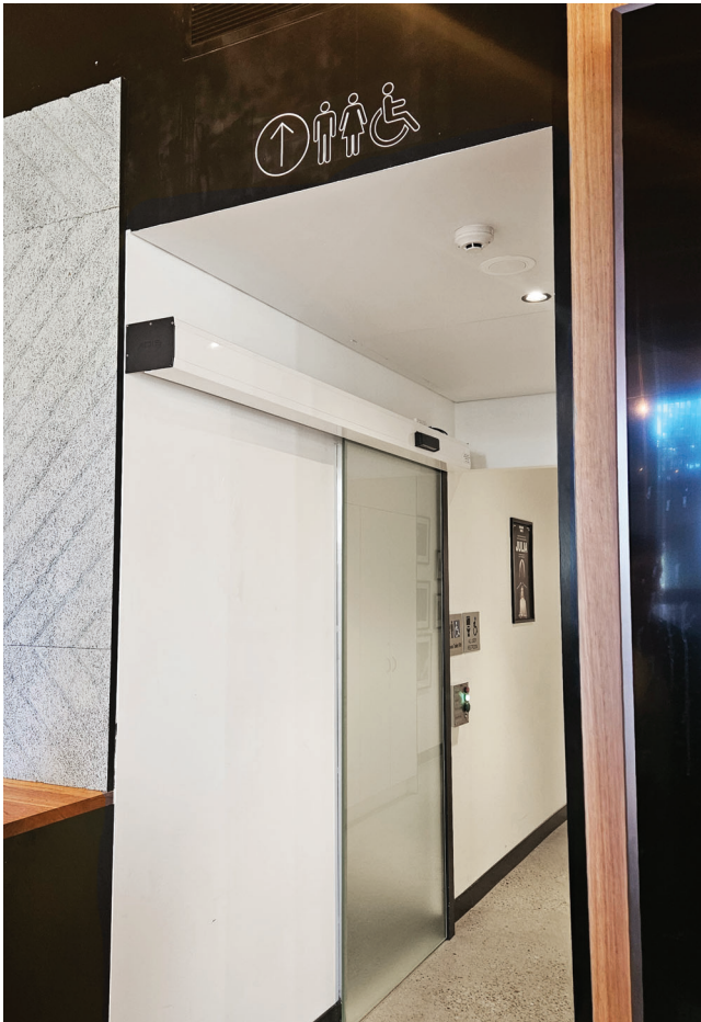
The corridor leading to the Bathrooms.

There is also one All User/Accessible bathroom. Inside this bathroom there is a handrail next to the toilet seat, a sink with a swivel mixer tap and a sharps disposal box. The bathroom is accessible by a push-button.